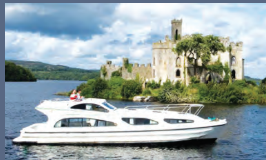
Crusing on the Shannon River