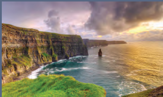
The Cliffs of Moher