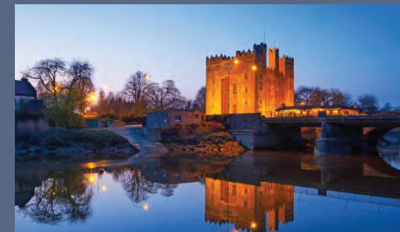
Bunratty Castle & Folk Park